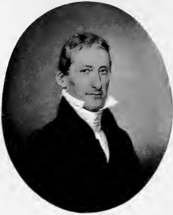
Colonel William Drayton By Charles Fraser Page 168